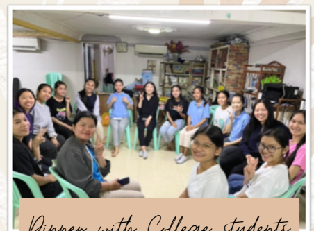
Dinner with College students

We never would have witnessed or have known about what God has been doing in Cambodia. But now we’ve seen and heard it. We can share it. We can pray for them. We can continue to support them. To send missionaries or go ourselves. Because we see the need for the gospel in the world. We see God’s work is continuing. The harvest is plentiful but the workers are few. We ought to continue to pray and seek God’s will and continue to carry out His love with others as we live in faith.