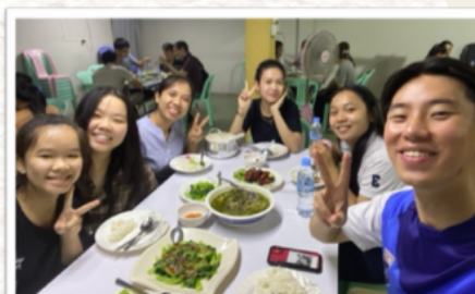
Dinner with College students at KCC