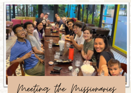
Meeting the Missionaries